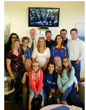
The Staff with some of our children

ServiceMaster specializes in restoration services that include water, fire/smoke, odor removal, mold, trauma, and vandalism. Their mission is to not only provide you with the best services available, but give you Peace of Mind ® that they will do everything possible to return your home or business to pre-loss condition. If you need their services, they can be reached at (800) 339-5720.